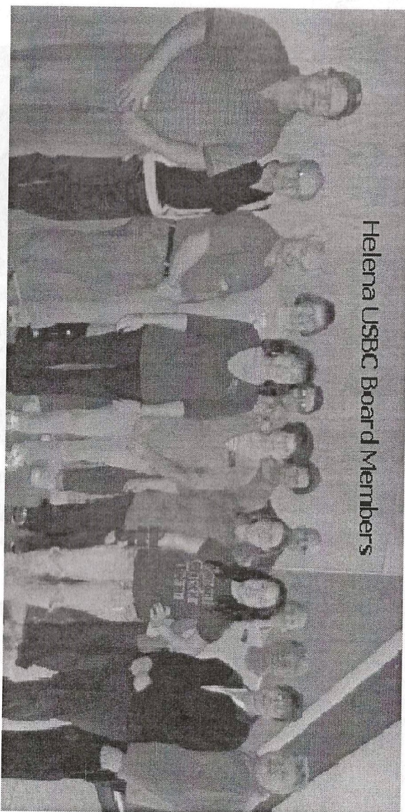
Helena USBC Board Members